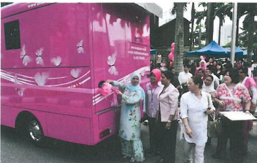
PUAN Sri Norainee officially launches BCWA's MURNI Programme.

T8 Freud Museum London celebrates 25th anniversary