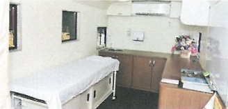
THE cosy interior of the Mobile Unit Reaching Nationwide with Information (MURNI) vehicle.

The MURNI programme which was launched by Yang Amat Berbahagia Puan Sri Norainee Abdul Rahman, wife of the Deputy Prime Minister today features a mobile unit equipped with early detection and supportive care tools and staffed by healthcare professionals and trained breast cancer survivors reaching out to rural communities in Malaysia. The aim of this programme is to provide guidance, encourage, empower and support women to practice a lifestyle of being breast aware, to seek out medical assistance for any abnormal changes in their breasts as well as to obtain timely medical treatment when they are diagnosed with breast cancer. To this end, the programme will involve a three-pronged approach, namely MURNI Early Detection, MURNI Supportive Care and MURNI Capacity Building. Puan Sri Datin Seri Dato' Akmal Abdul Salam who is patron of BCWA, said: "Breast cancer is