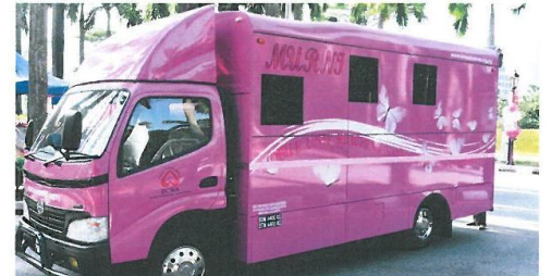
The bright pink colour of the mobile unit ensures that it attracts attention, especially from womenfolk.

S AVING lives through early detection has been the cornerstone of the Breast Cancer Welfare Association (BCWA) Malaysia's efforts since its inception in 1986. Recently, BCWA is touching the lives of womenfolk in Malaysia's rural outskirts to empower them to take control of their lives by practising early detection of breast cancer through its unique MURNI (Mobile Unit Reaching Nationwide with Information) programme.